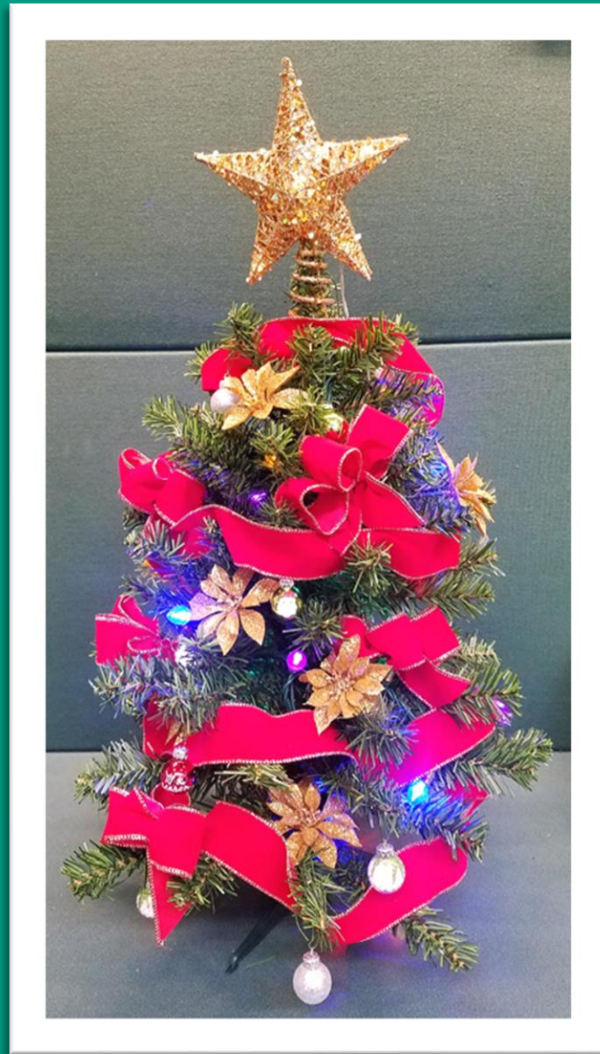
FFC Downtown Branch