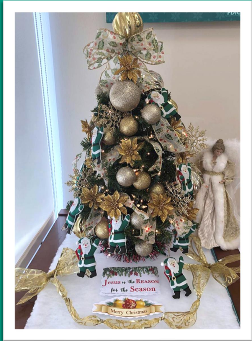
FFL Kailua Branch