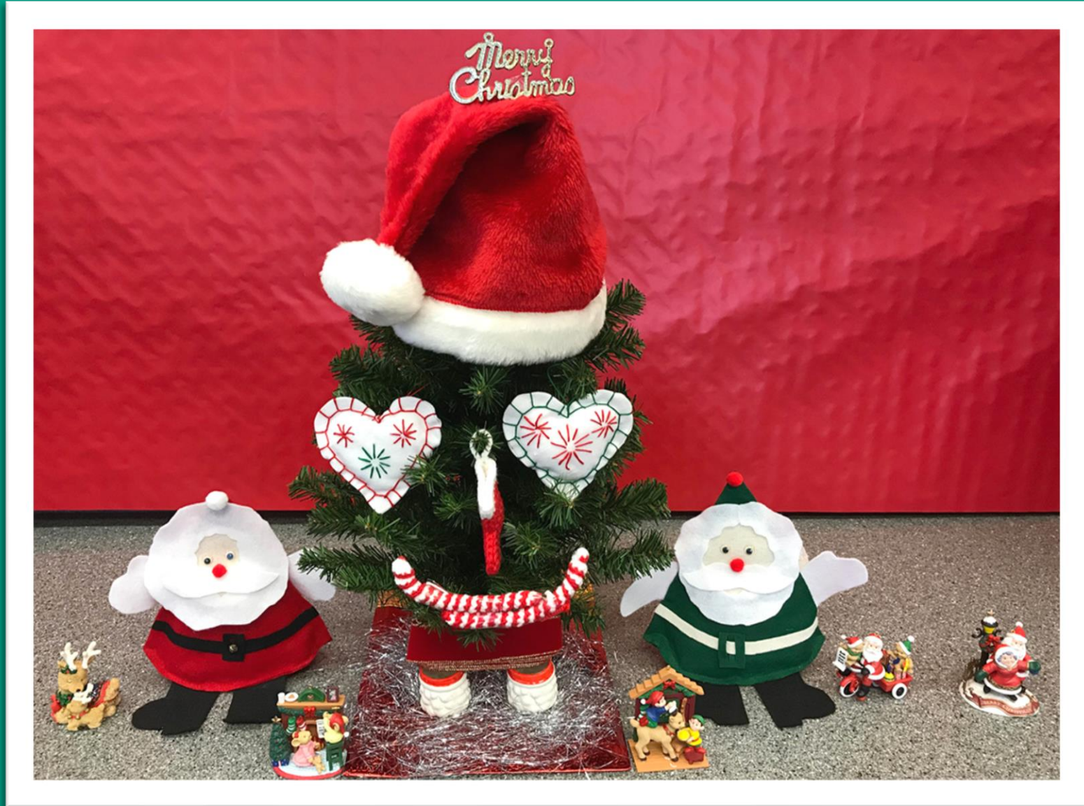
FFL Pearl City Branch