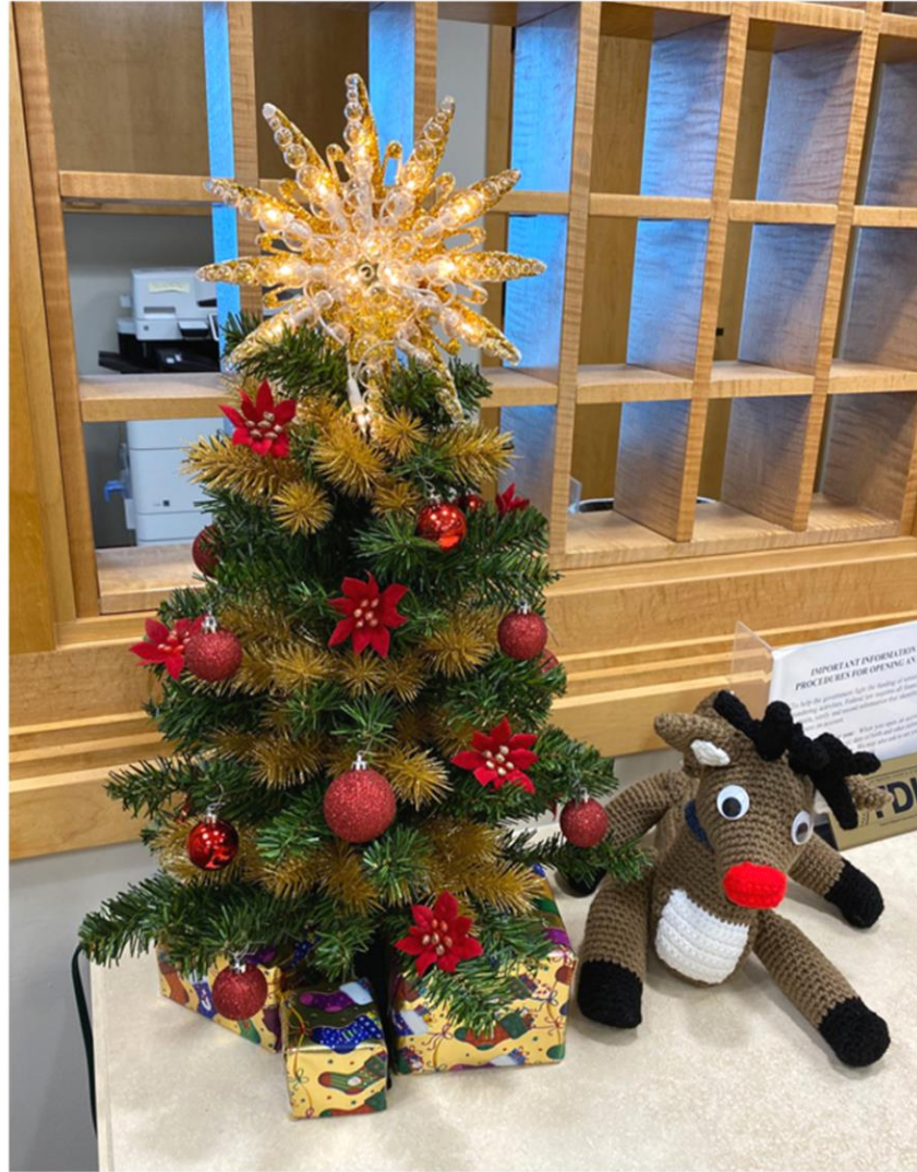
FFL Kaimuki Branch