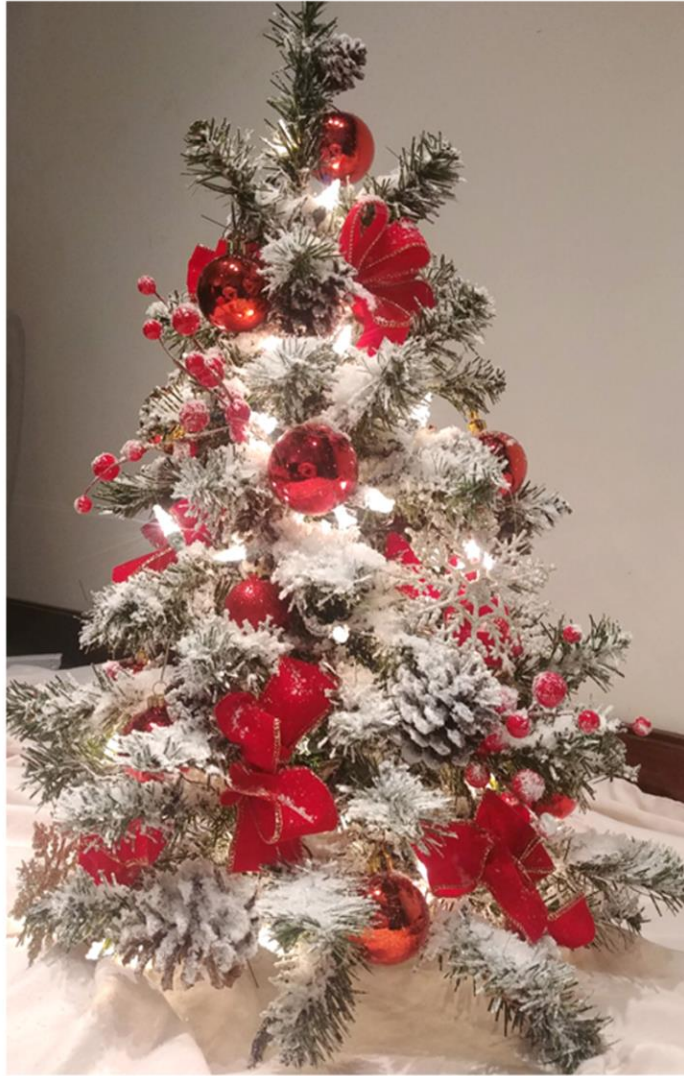
FFL Executive Office, 10 th Floor