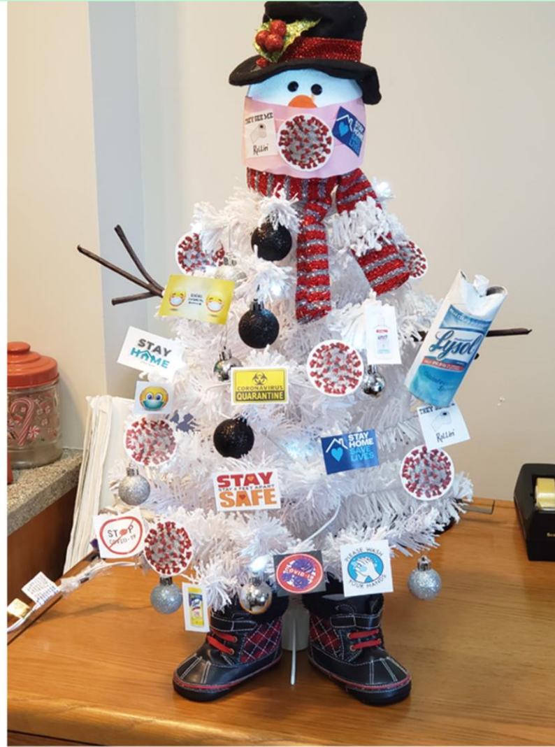
FFL Kahului Branch