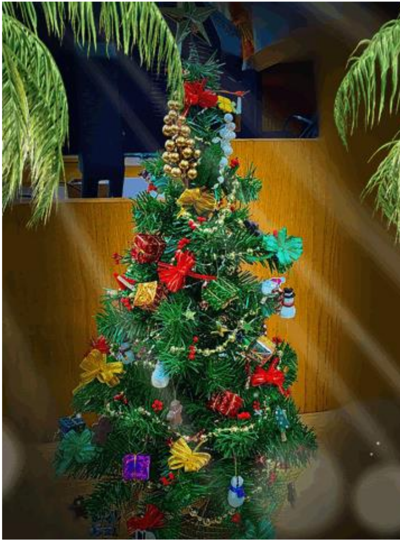
FFL Lihue Branch