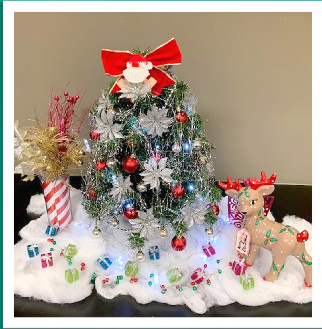
FFL Kapiolani Branch