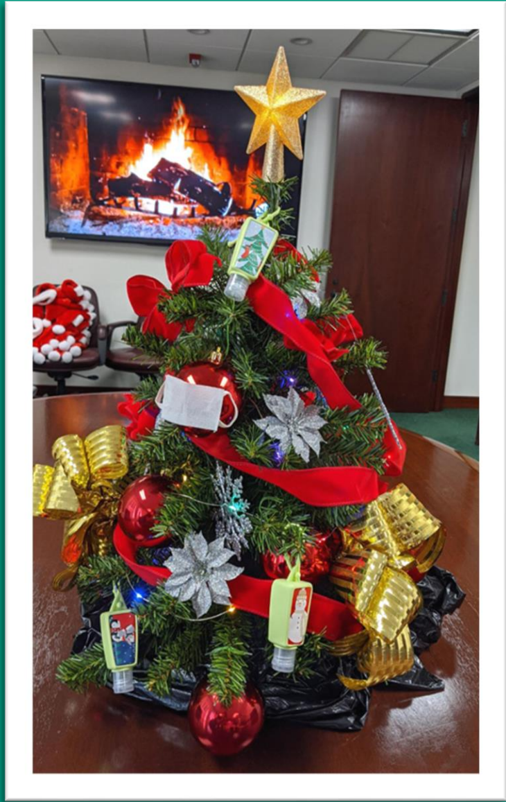
Waipono Investment Corporation