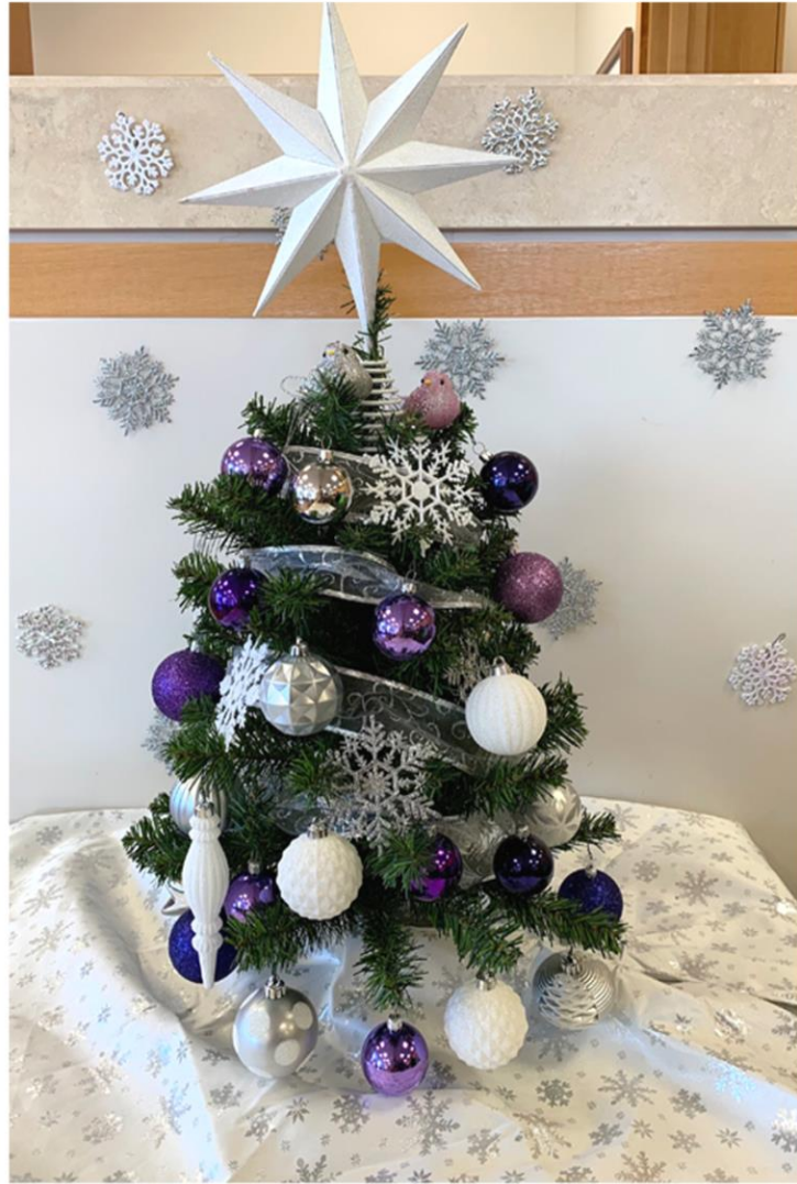
FFC Liliha Branch