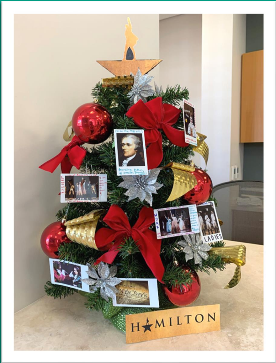
FFL Manoa Branch