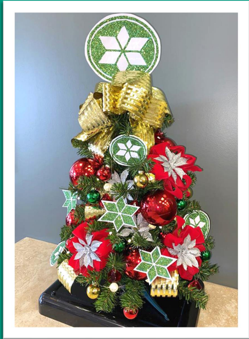
FFL Kahala Branch